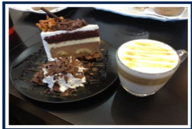
My cake and coffee

I finally decided the best way to celebrate my birthday was for our family to go out to eat something nice and then have cake and coffee at our favorite coffee shop; that is what we did and it was a wonderful day. I am also thankful for all the nice birthday wishes I received from so many friends. Praise God! I am the most blessed man I know.