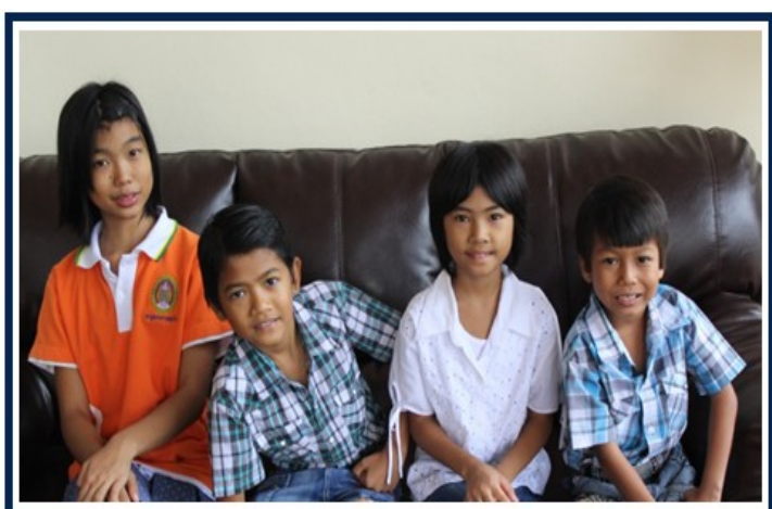
Our Home of Hope Children

I know I talk a lot about all the orphaned and abandoned children here in Thailand, but I just want to inspire everyone to see the true potential that God has in mind for this country. When I think of God directing us to rescue these children and raise them up with the love and care that they deserve, discipling them in the word of God, I get so excited. I am reminded of how God has not chosen many wise according to the flesh, not many mighty, not many noble, are called. But God has chosen the foolish things of the world to put to shame the wise, and God has chosen the weak things of the world to put to shame the things which are mighty; and the base things of the world and the things which are despised God has chosen. (1 Cor 1:26-28)