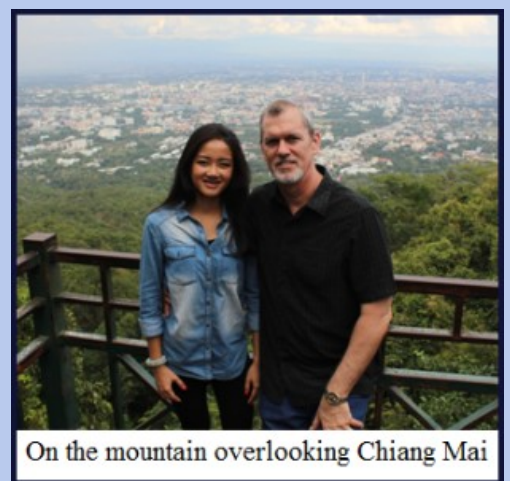
On the mountain overlooking Chiang Mai