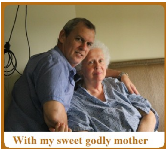
With my sweet godly mother

My trip to the US was successful and blessed. I trusted God to provide for the finances needed to make the trip so that I could be with my mother during her heart surgery. She went through the surgery well and is now at home recovering. Praise God! I was able to sit with her every day, hold her hand and pray with her; what a blessing that was. I also had a great time visiting with my son, daughter-in-law and grand children. I was so blessed to also spend time with some of our friends and partners.