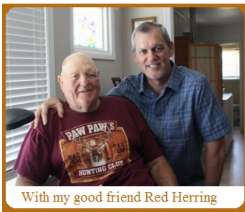
With my good friend Red Herring