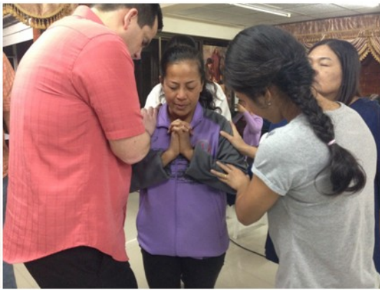
Believers laying hands on the sick and seeing them healed