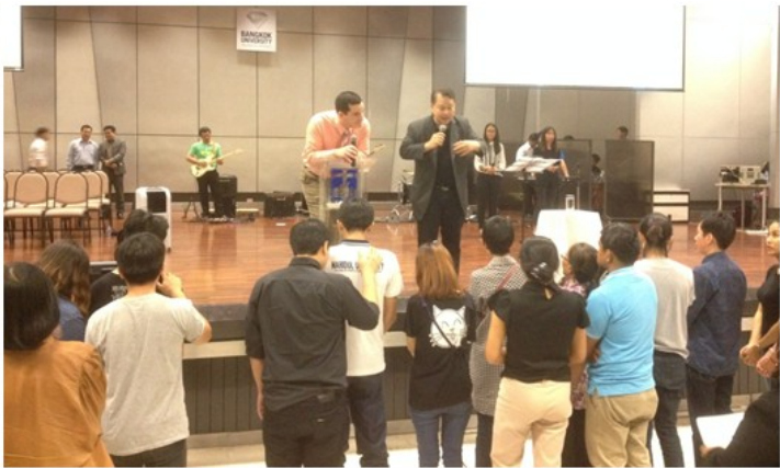
Many came forward to receive Christ