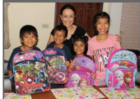
The other kids got gifts too