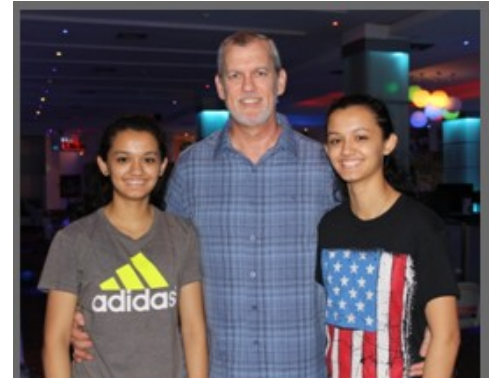
At the bowling alley with the girls for their birthday