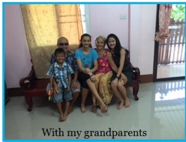
With my grandparents